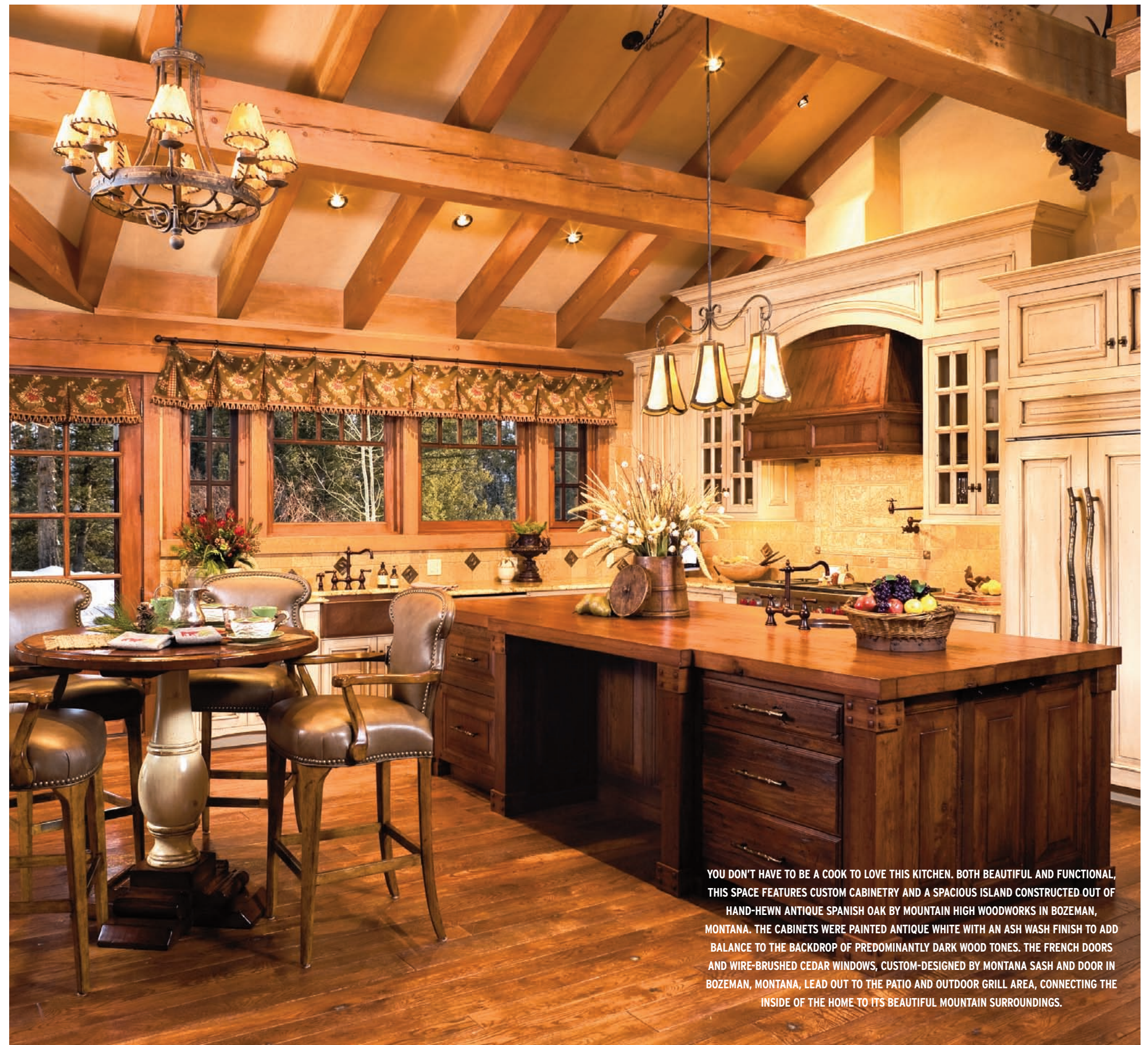
YOU DON'T HAVE TO BE A COOK TO LOVE THIS KITCHEN. BOTH BEAUTIFUL AND FUNCTIONAL, THIS SPACE FEATURES CUSTOM CABINETRY AND A SPACIOUS ISLAND CONSTRUCTED OUT OF HAND-HEWN ANTIQUE SPANISH OAK BY MOUNTAIN HIGH WOODWORKS IN BOZEMAN, MONTANA. THE CABINETS WERE PAINTED ANTIQUE WHITE WITH AN ASH WASH FINISH TO ADD BALANCE TO THE BACKDROP OF PREDOMINANTLY DARK WOOD TONES. THE FRENCH DOORS AND WIRE-BRUSHED CEDAR WINDOWS, CUSTOM-DESIGNED BY MONTANA SASH AND DOOR IN BOZEMAN, MONTANA, LEAD OUT TO THE PATIO AND OUTDOOR GRILL AREA, CONNECTING THE INSIDE OF THE HOME TO ITS BEAUTIFUL MOUNTAIN SURROUNDINGS.

FOR HOMES LOCATED IN COOLER CLIMATES, CONSIDER INCORPORATING A WARM PALETTE OF COLORS THROUGHOUT THE INTERIOR TO CREATE A COZY AND INVITING ATMOSPHERE.