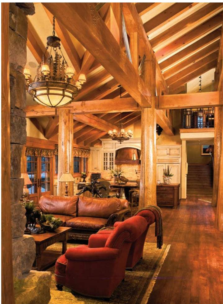
THOUGH EXPANSIVE, THE GREAT ROOM IS DIVIDED INTO SMALL NOOKS WHERE FAMILY MEMBERS AND GUESTS CAN BREAK INTO SEPARATE ACTIVITIES AND CONVERSATIONS.