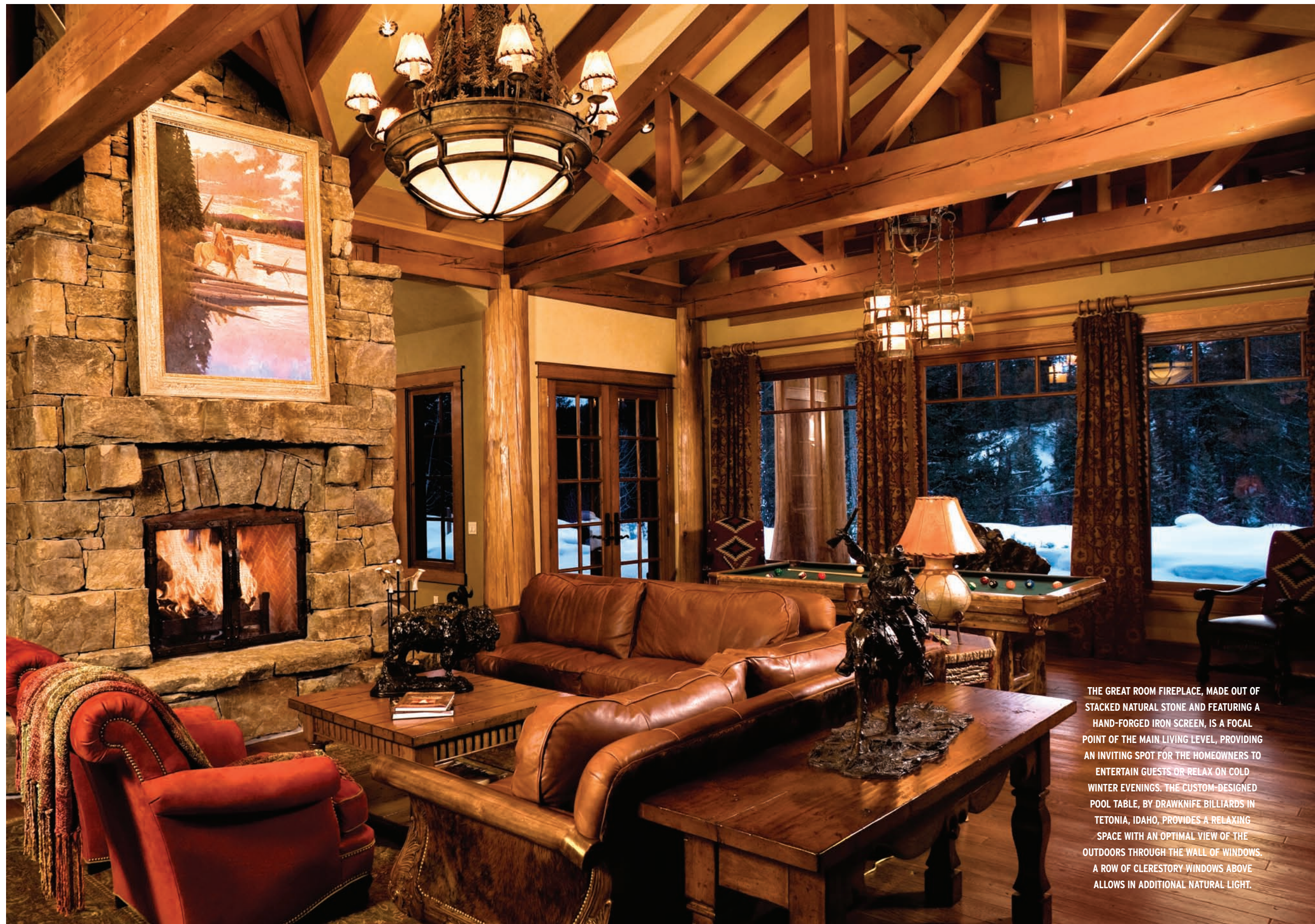
THE GREAT ROOM FIREPLACE, MADE OUT OF STACKED NATURAL STONE AND FEATURING A HAND-FORGED IRON SCREEN, IS A FOCAL POINT OF THE MAIN LIVING LEVEL, PROVIDING AN INVITING SPOT FOR THE HOMEOWNERS TO ENTERTAIN GUESTS OR RELAX ON COLD WINTER EVENINGS. THE CUSTOM-DESIGNED POOL TABLE, BY DRAWKNIFE BILLIARDS IN TETONIA, IDAHO, PROVIDES A RELAXING SPACE WITH AN OPTIMAL VIEW OF THE OUTDOORS THROUGH THE WALL OF WINDOWS. A ROW OF CLERESTORY WINDOWS ABOVE ALLOWS IN ADDITIONAL NATURAL LIGHT.

Following Olson's vision, Daugaard set out to achieve the architectural style of a mountain lodge and the effect of a ranch cabin reminiscent of