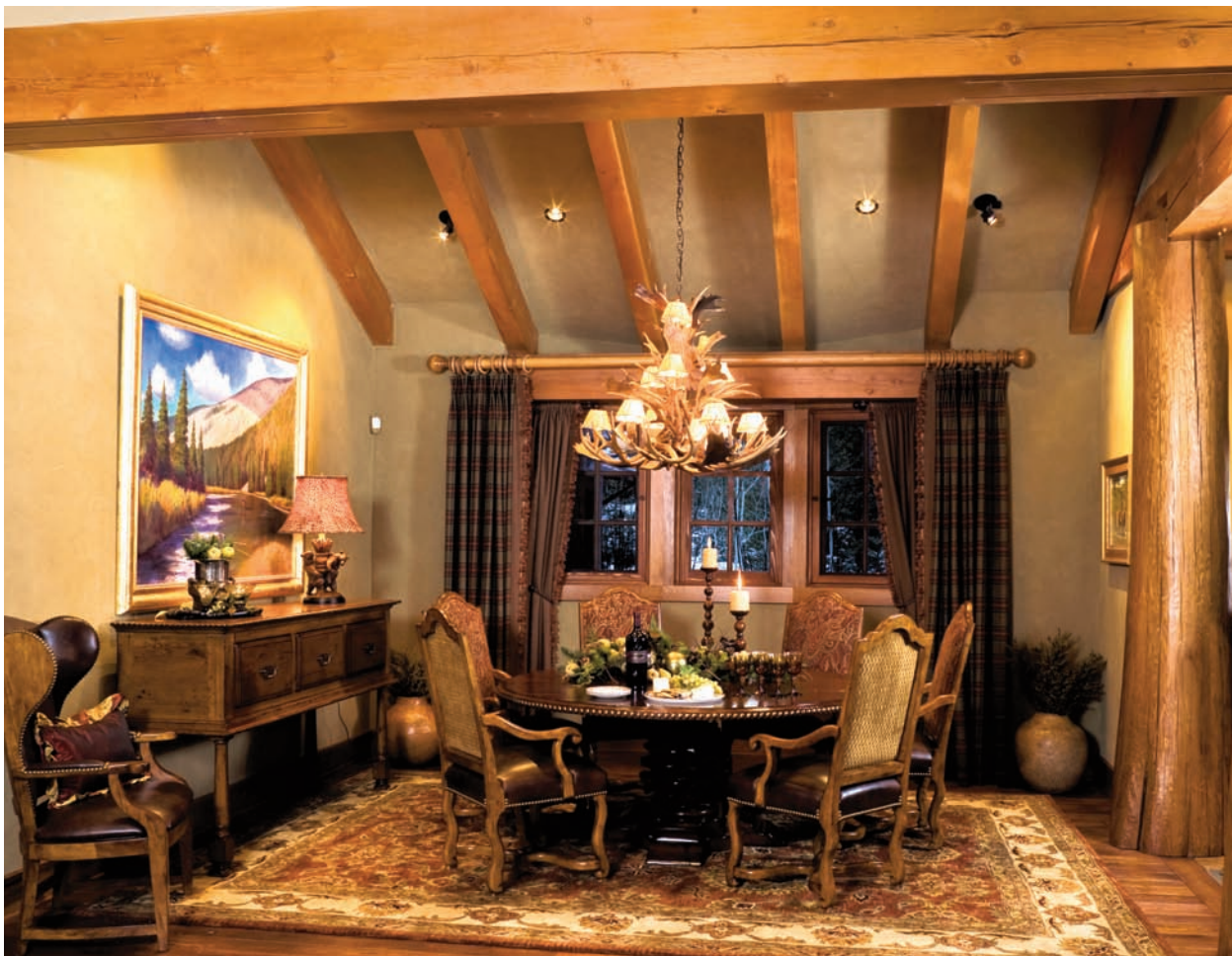
THOUGH THE DINING ROOM FLOWS INTO BEAR BASIN RANCH'S OPEN FLOORPLAN, THE SPACE WAS FLANKED WITH LARGE LOG COLUMNS TO CREATE A SNUG ALCOVE WHERE THE FAMILY CAN GATHER AROUND THE HAND-CARVED DINING ROOM TABLE, FEATURING AN ORNATE PINECONE SUPPORT, AFTER A BUSY DAY.

America's national parks, particularly nearby Yellowstone. He designed ceiling lines slightly lower than one might find in most log homes, for example, while keeping a height that would expose the beauty of the roof's thick beams and trusses. Clerestory windows in the great room allow the warmth of natural light to extend into the interior spaces. Cedar shake roofing with copper accents tops off a look that blends into the home's surroundings.