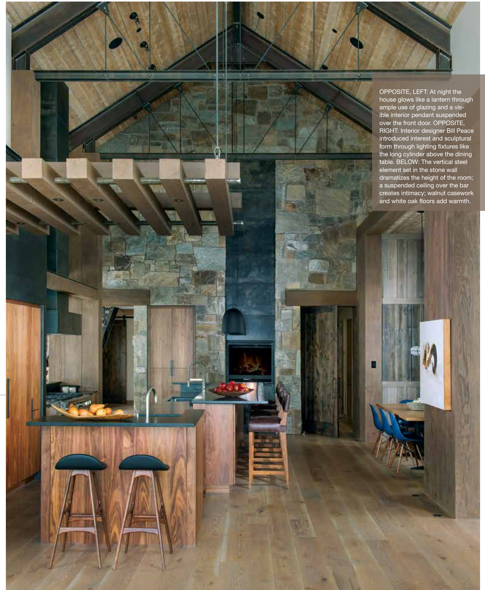
OPPOSITE, LEFT: At night the house glows like a lantern through ample use of glazing and a visible interior pendant suspended over the front door. OPPOSITE, RIGHT: Interior designer Bill Peace introduced interest and sculptural form through lighting fixtures like the long cylinder above the dining table. BELOW: The vertical steel element set in the stone wall dramatizes the height of the room; a suspended ceiling over the bar creates intimacy; walnut casework and white oak floors add warmth.

The main stairwell furthers the aesthetic with open risers and cable sides instead of solid panels. A wood-and-metal trellis suspended over the bar creates a feeling of intimacy without compromising its airiness. And in the great room, with its square shape, high ceilings and floor-to-ceiling glass walls crowned by a simple >>