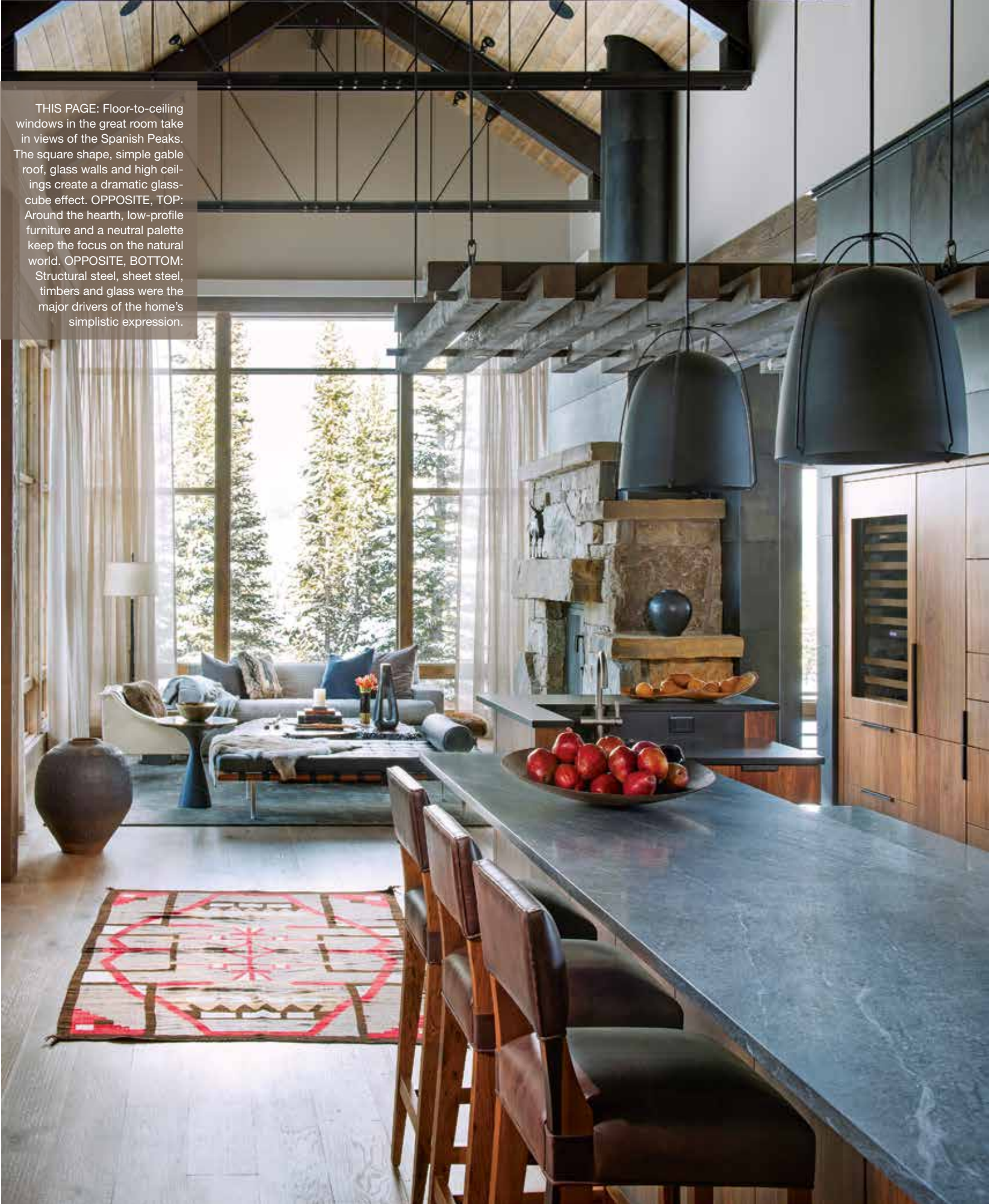
THIS PAGE: Floor-to-ceiling windows in the great room take in views of the Spanish Peaks. The square shape, simple gable roof, glass walls and high ceilings create a dramatic glass-cube effect. OPPOSITE, TOP: Around the hearth, low-profile furniture and a neutral palette keep the focus on the natural world. OPPOSITE, BOTTOM: Structural steel, sheet steel, timbers and glass were the major drivers of the home's simplistic expression.