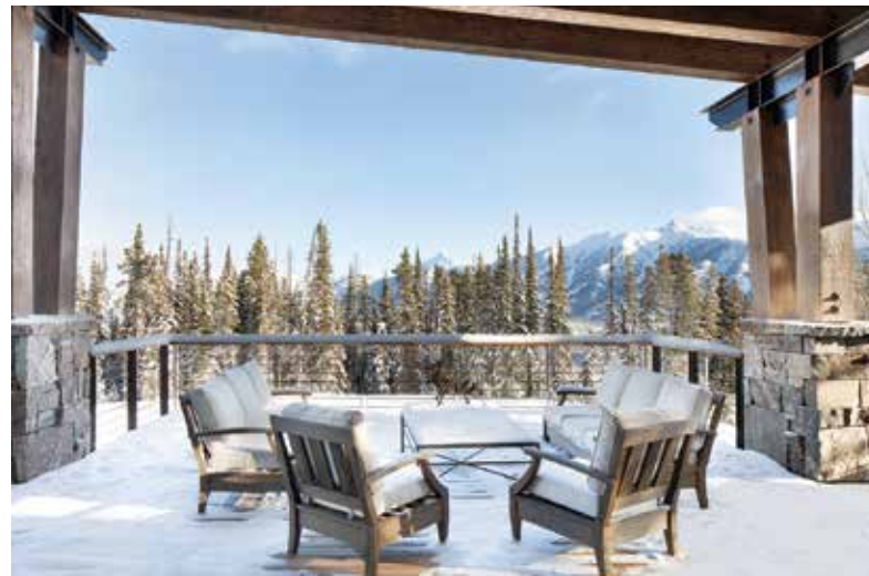
The back deck, which offers expansive mountain views, features a mix of local Montana stone and wood, applied with clean lines and minimal detail to create a modern rustic aesthetic.

The main entrance to the house features an oversized wood door of hand-hewn timber slabs flanked by glass panels. Guests then pass under an elevated steel bridge that leads to the top floor childrens’ bedrooms and a common work/play space. The open living space on the main floor opens up dramatically upon entering the great room/dining/kitchen area. There, large glassed volumes and a soaring ceiling are