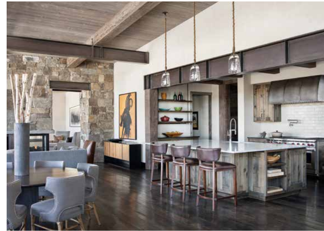
FROM TOP: The kitchen island provides plenty of space for cooking or casual dining. The ochre in the painting Barrido by Duke Beardsley provides a strong visual in the living area that’s otherwise commanded by natural stone, wood, and a color palette reminiscent of the Montana landscape. • The ski room features radiant-heat concrete floors with boot warmers, space to hang helmets and gloves, and lockers made of reclaimed wood.

It was important that the new home fit with the character of