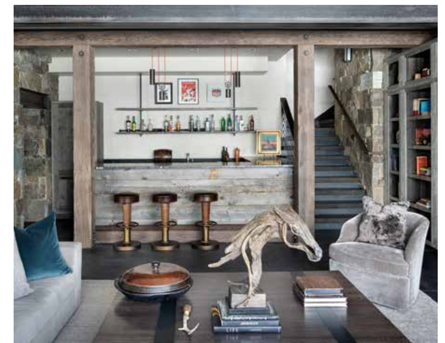
FROM TOP: Alexander & Avery by Anke Schofield and Luis Garcia Nerey is the focal point in the master bedroom. Soothing tones of slate blue in the draperies and rug mixed with gray woods echo the sky and forest outside. • The family room features a reclaimed wood bar, and the wood and iron coffee table anchors the space.

Upon returning from a day of skiing, the homeowners come through a covered entry to the downstairs ski room, which features a custom boot rack wall and large ventilated cupboards for gear storage. This opens into a steel-beamed, wood-columned family room with comfortable seating, cleverly integrated bunk beds, a bar, TV, fireplace, and a wine room accessed through a steel door. Throughout the home, carefully curated