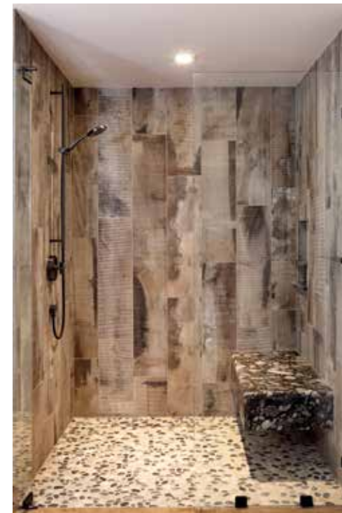
FROM TOP: The tile in this shower mimics weathered wood paneling. • Reclaimed tin and retro light fixtures add a historical flair to the bar on the ground floor.

Ever vigilant for opportunities to meld form and function, the team jumped at the opportunity to turn what was a necessary structural component into a useful — and fun — feature: Because of the slope of the property, the outdoor oven required a massive