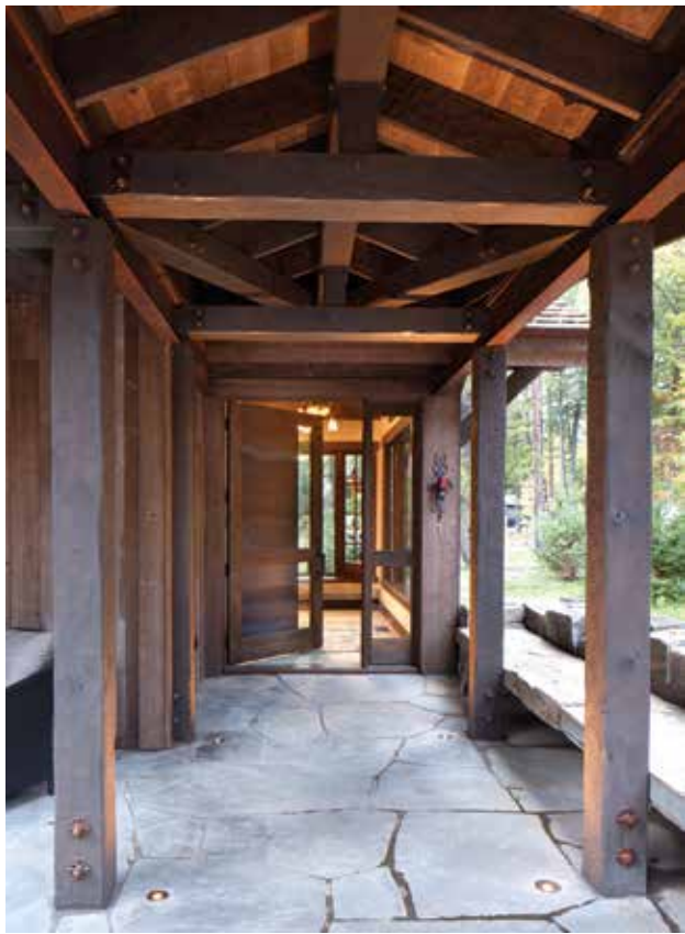
FROM TOP: The patio’s flagstone transitions seamlessly into the mudroom floor, to blur the line between indoors and out. • The home makes the most of the lake views, with custom couches that invite visitors to relax and enjoy the scenery.

That eye toward functionality meant choosing a layout that was both practical and aesthetically pleasing. A mudroom and