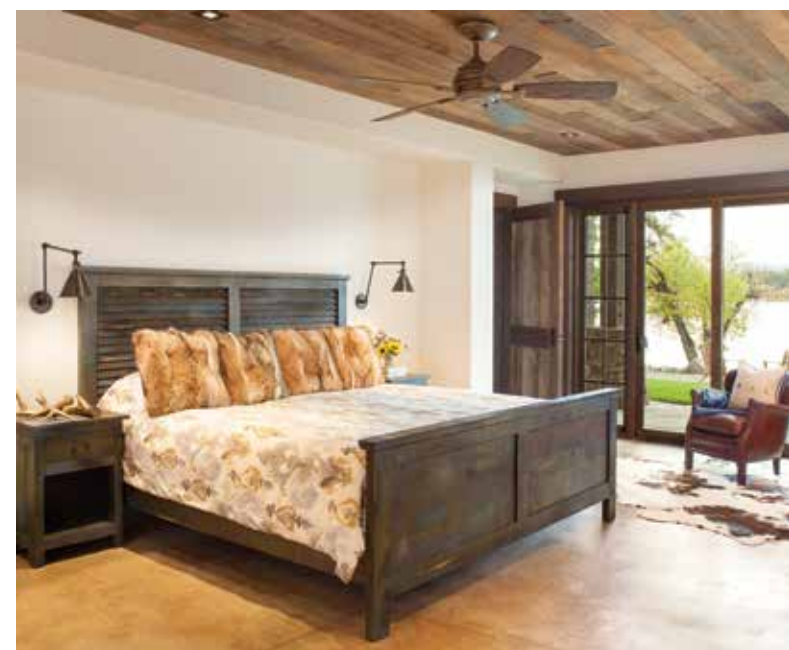
FROM TOP: The family had a historic canoe repurposed as a light fixture, which highlights the outdoor dining space. • Guest accommodations include doors that access the patio and lakefront.

This fluidity between indoor and outdoor living spaces was a primary goal of the homeowners and the design team. As a predominantly summer residence, the house needed to allow its inhabitants to capitalize on Montana's beautiful-but-brief months of warmth. "We wanted to be able to spend most of the time outdoors, and wanted the home to be conducive to that, with seamless access to the outside," the homeowner says. Sliding NanaWall doors on the ground floor invite guests to wander between the entertainment room and lakeshore. A spacious, partially covered deck on the main floor offers outdoor seating and dining, a commanding stone fireplace, and, perhaps the highlight of the space, a wood-fired oven.