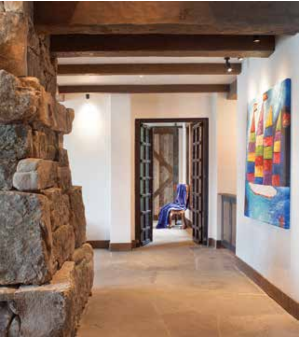
FROM TOP: A bright subway tile backsplash in the kitchen offers striking contrast to the weathered metal fixtures and rustic cabinetry. • Raw stone and wood provide the perfect background for well-placed contemporary art.

Material choices were critical to the home’s livability as well. One illustration of this is the flagstone flooring that plays a starring role in the house — and continues into the outdoor living spaces. “The whole main floor is flagstone, which we wanted to do because of the dogs — it’s more durable,” the homeowner says. And the uninterrupted flooring “also makes it so you don’t quite know if you’re inside or outside.”