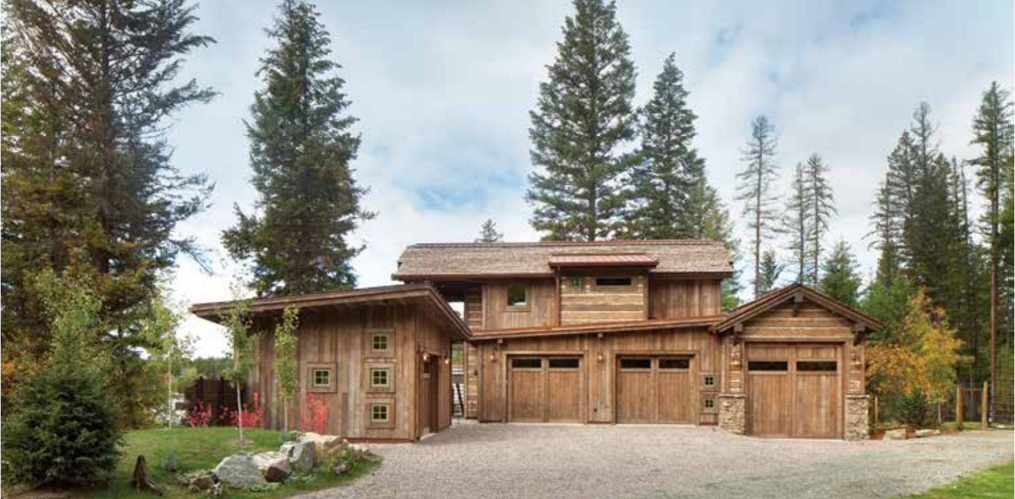
A guest apartment over the garage offers a more private option for visitors.

to a level of rustic elegance and mindful intentionality: the canoe-turned-chandelier in the outdoor dining room; the uncompromising, timeless quality of the stonework throughout; antique furniture discovered during the homeowners' travels; steel details, including an accent wall, the range hood, and the turnbuckles spanning the beams in the great