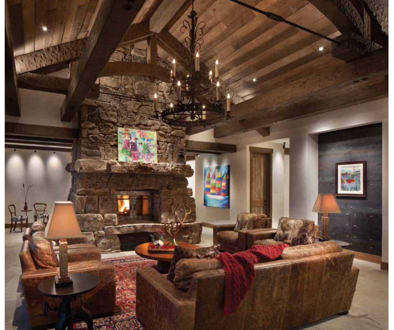
OPPOSITE PAGE: Approached from the water, this home is reminiscent of the grand lakeside lodges of the past. FROM ABOVE: The great room combines rustic elements of stone, timber, and turnbuckles with modern accents, such as sheet metal and rivets. • Double islands in the kitchen are the perfect solution for entertaining while cooking.

But upon closer inspection, it immediately becomes clear that this a much newer home, built in 2014, although no less grand for its newness. And the nod toward history is no accident. “We liked the rustic look,” says the homeowner. “We wanted the house to look as if it had been there a long time, and to blend into the surrounding landscape.”