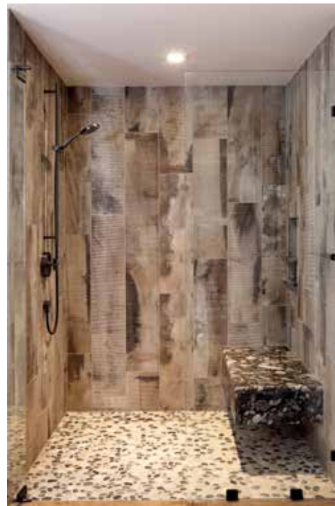
FROM TOP: The tile in this shower mimics weathered wood paneling. • Reclaimed tin and retro light fixtures add a historical flair to the bar on the ground floor.

Ever vigilant for opportunities to meld form and function, the team jumped at the opportunity to turn what was a necessary structural component into a useful — and fun — feature: Because of the slope of the property, the outdoor oven required a massive