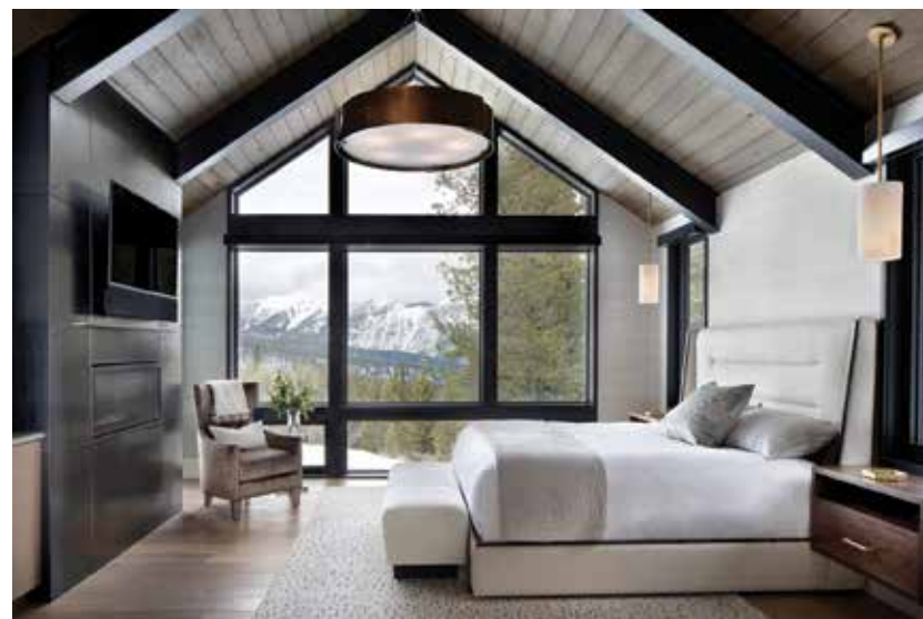
FROM TOP: The wall of windows lets natural light into this lower-level game room. • A second gabled form — smaller than that of the main entrance and great room — houses the primary bedroom suite.

to blend from space to space to space,” explains Daugaard. To that end, the architect used the stairs to create a flow between both levels — the entire section of wall features glass and steel over two stories — and to bring light into the lower bedrooms, bunkroom, and game room. “The staircase is a great piece,” says Lee. “The architect and the owners wanted a surround of glass. It’s a big feature inside, but you can also experience it from the outside, especially in the evening. The home glows; you feel like you’re inside even when you’re on the back patio.”