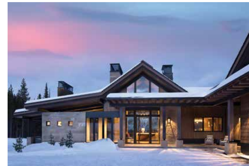
FROM TOP: Viewed from the arrivals court, the architecture signals the surprise inside. • The kitchen features clean lines and neutral tones, and it opens to the dining room so that the cook can be in on the action.

From the arrival area on the uphill side, the home’s promise is immediate. The view across the valley to the mountains draws attention even before reaching the door, while to the left, a wall of Montana sandstone —