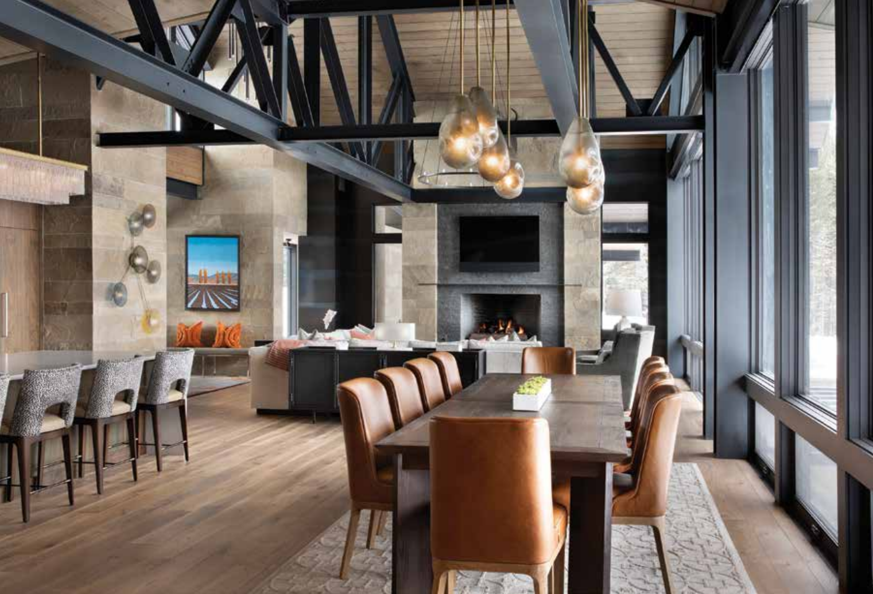
FROM TOP: Two parallel steel chord trusses that span from the grand staircase through the great room to the kitchen and dining areas transform on both ends into traditional gable trusses. Interior designers Kelly Lovell and Ashley Sanford of Clean Line Consulting worked closely with the homeowners to identify the stars of the lighting scheme; one was the custom wall sconce from Tracy Glover Studio in the entry/great room. • An outdoor, all-season space is sheltered from the weather, yet open to the sublime views. The two-sided fireplace creates privacy and a sense of connectedness for those enjoying the hot tub.

aligned with the hillside. Two prominent gabled structures — the larger one creating a drama-rich view corridor from the front door, and the second housing the primary bedroom suite — focus on views of the Spanish Peaks. A shed-roof portion extends out on the western end, balancing the home’s mass and creating an outdoor living area that’s sheltered from the elements but gloriously open to the view. The shed roof is an integral part of the design, producing a soft line that terraces down and ties into the topography. On the home’s downhill side, a monumental wall of windows flows from the main floor to the lower level, drawing light deep into the interiors. The structural expression of the steel, meanwhile, is minimal on the home’s exterior, yet central to the interior experience.