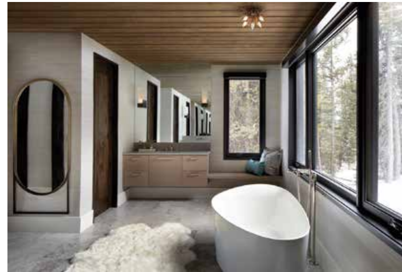
A floating tub is the grounding element and focal point in this serene bathroom.

to blend from space to space to space,” explains Daugaard. To that end, the architect used the stairs to create a flow between both levels — the entire section of wall features glass and steel over two stories — and to bring light into the lower bedrooms, bunkroom, and game room. “The staircase is a great piece,” says Lee. “The architect and the owners wanted a surround of glass. It’s a big feature inside, but you can also experience it from the outside, especially in the evening. The home glows; you feel like you’re inside even when you’re on the back patio.”